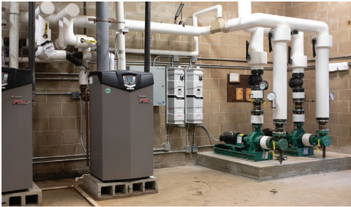
The City of Pawtucket's investment in building management systems helped to significantly reduce energy costs.