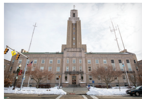
Pawtucket's town hall was one of the city's facilities that had a National Grid no-cost energy audit.